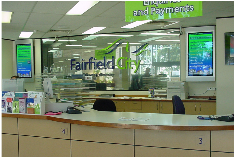
Two screens located behind the service counter